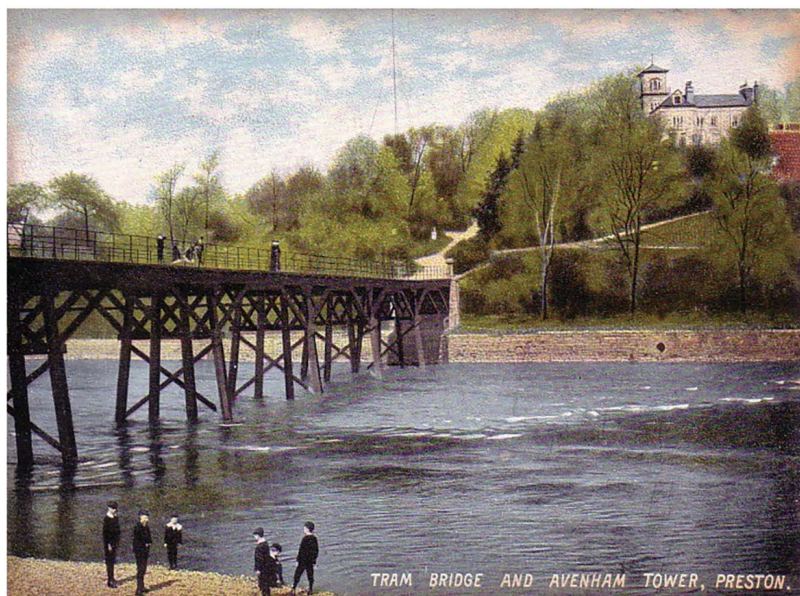
Tram Bridge and Avenham Tower

Central Methodist Church, Lune Street, Preston